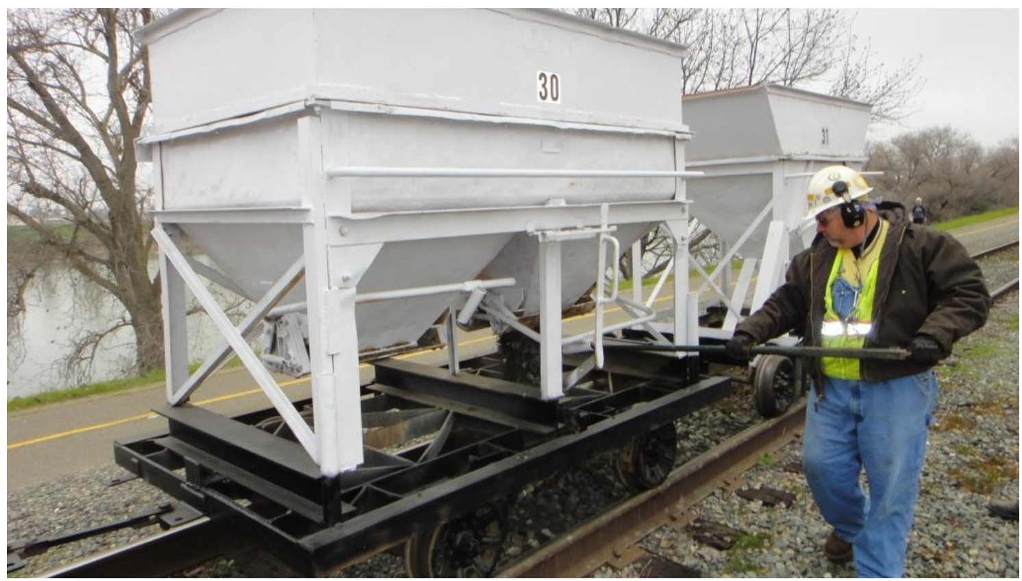
Mike F. opens the clamshells to release rock from the center dump ballast hopper