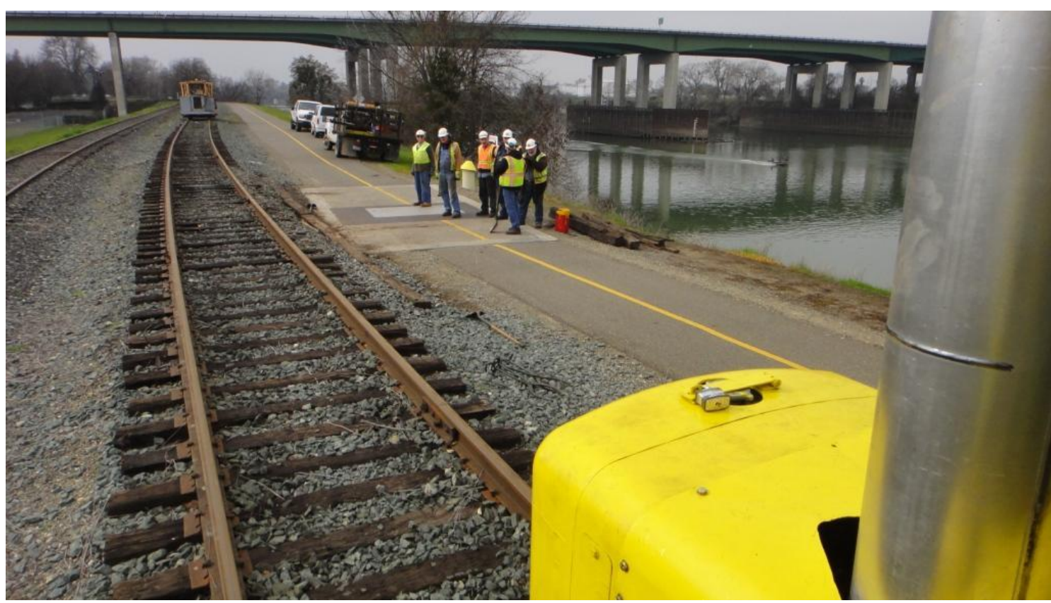
Pursuant to 49 CFR Part 214, the MOW Team stands aside in the designated safety zone as the tug heads back to Setzer for a refill of rock