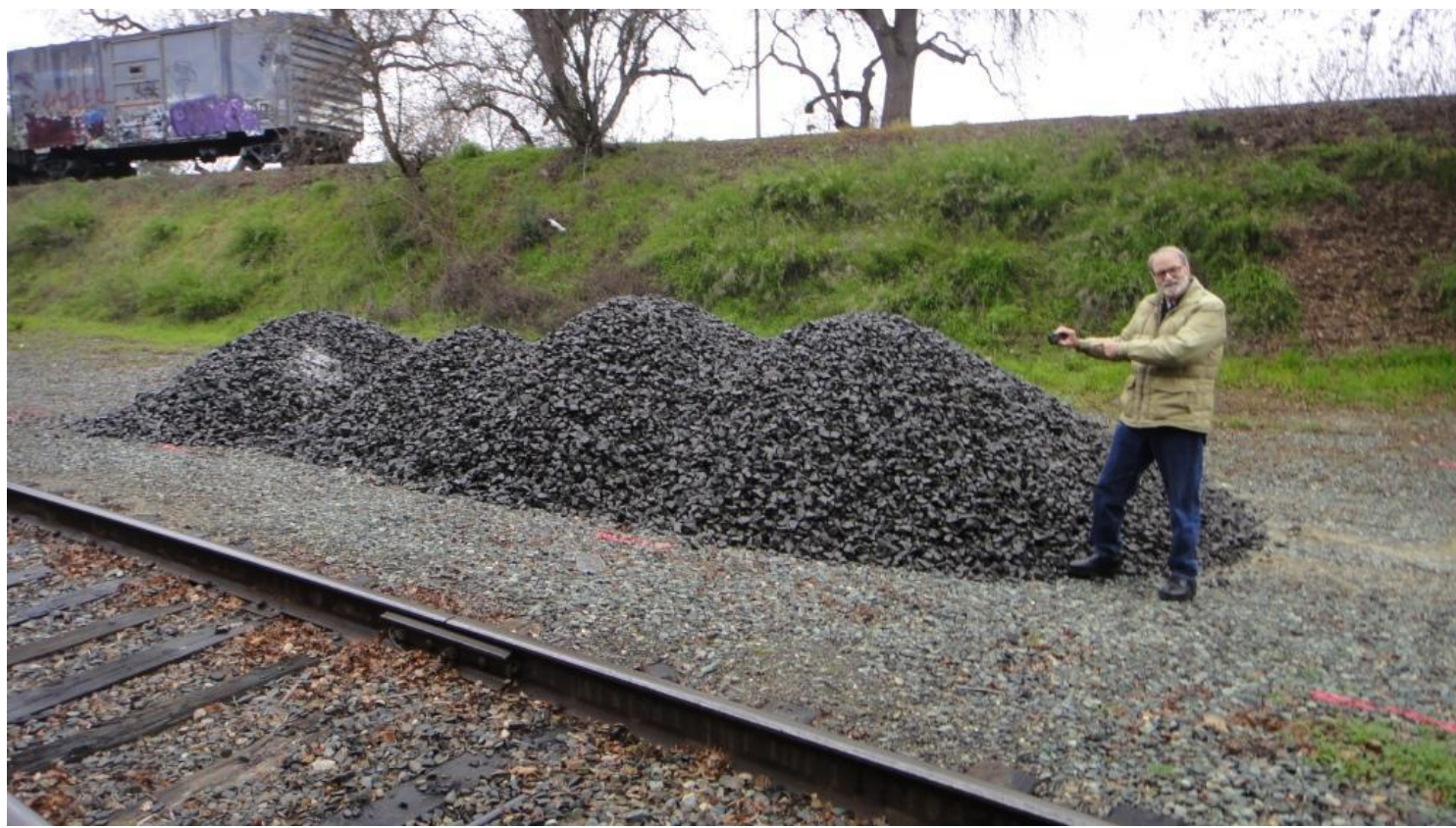
Alan celebrates the arrival of the first 50 tons of ballast rock