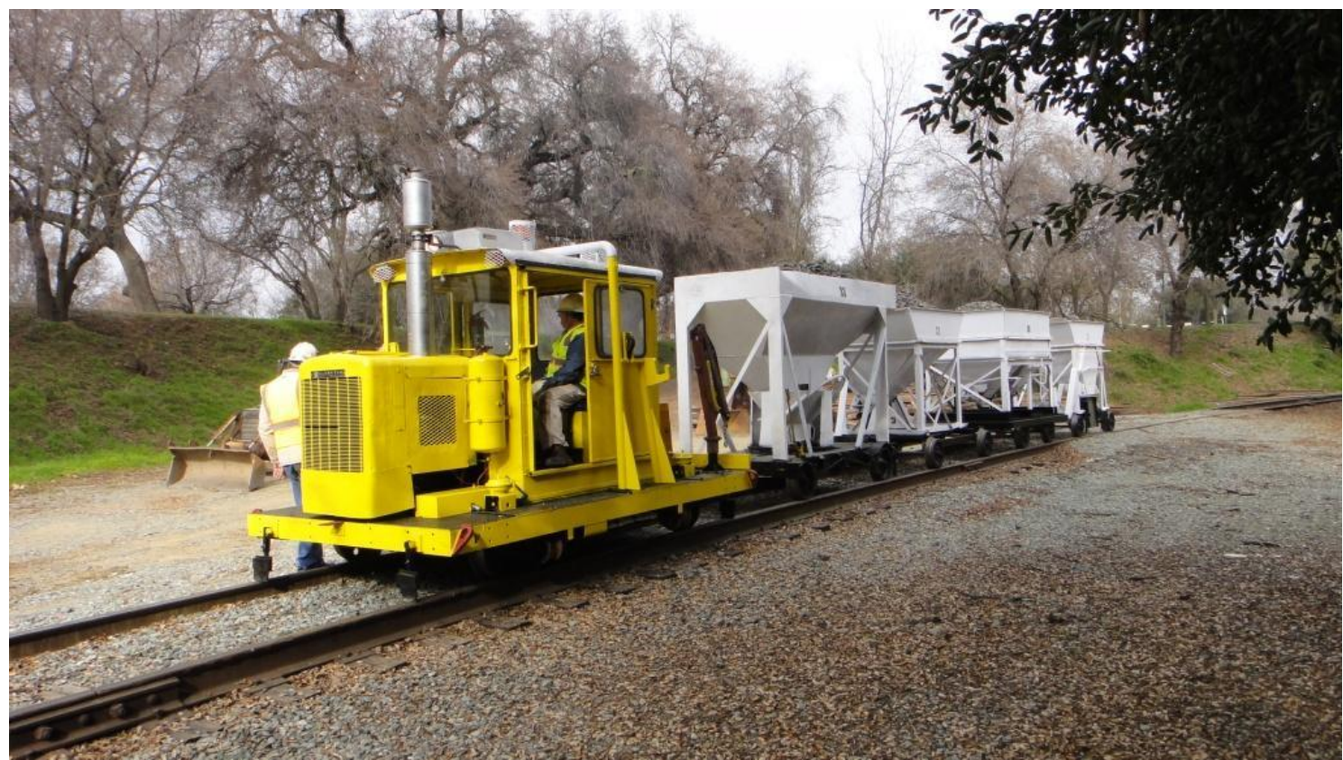
The Kalamazoo tug is ready to pull 15 tons of rock up the Setzer Grade