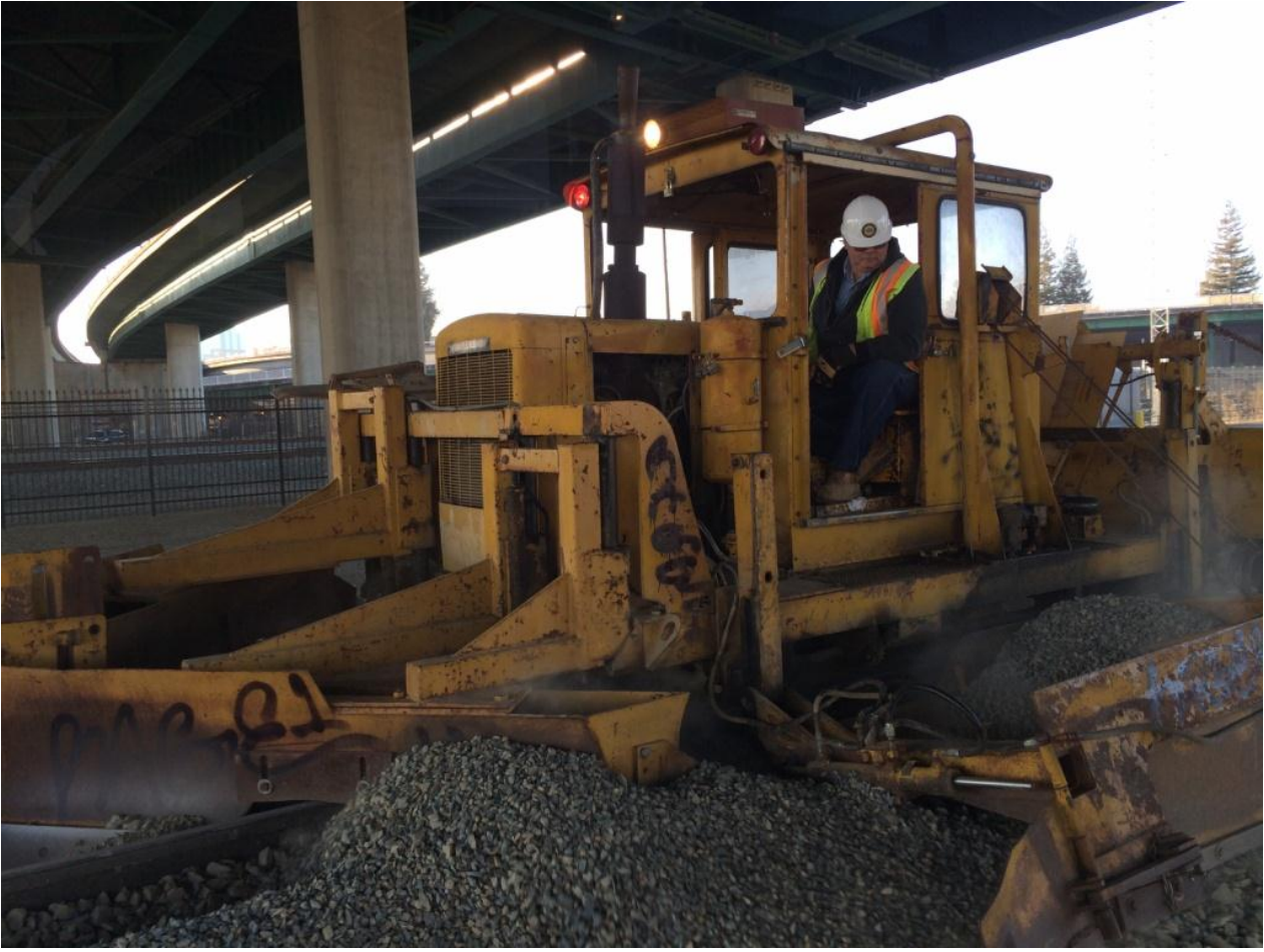
With no snow to plow, Chris plows rock instead...