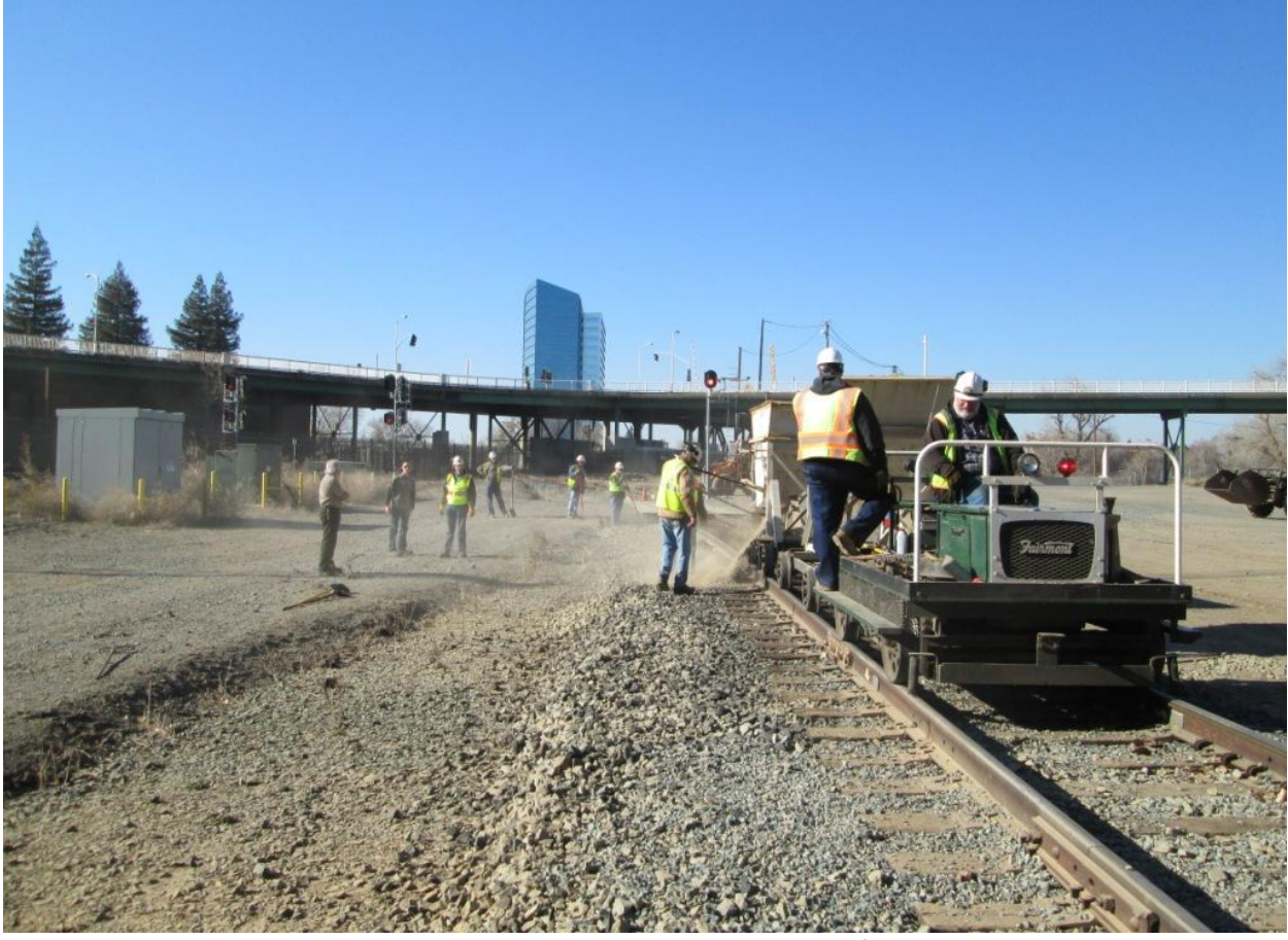
Your MOW Team building the CPUC required foot paths.