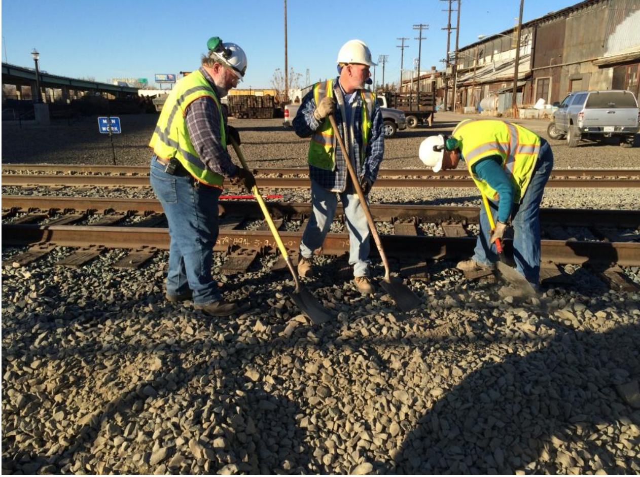
"Drill, Ye Tarriers, Drill"...