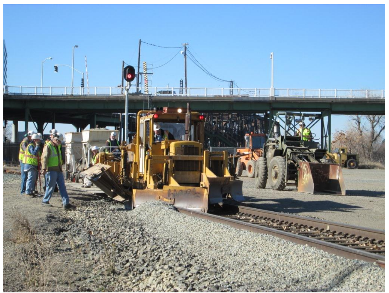
People and machines working together like God intended