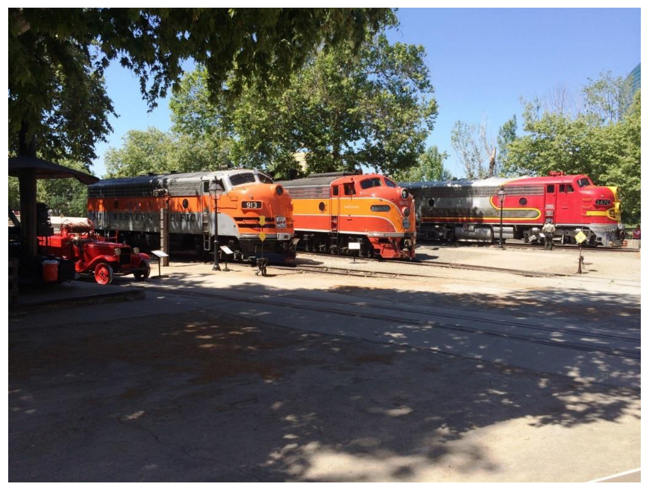
The fleet in formation...