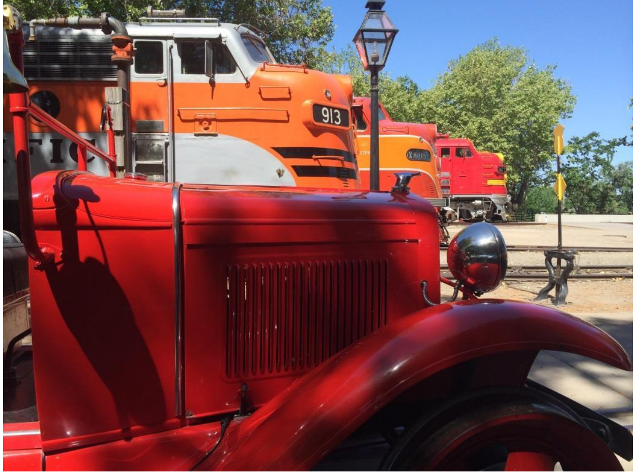
On National Train Day, a couple other artifacts took their place alongside the MOW fire truck...