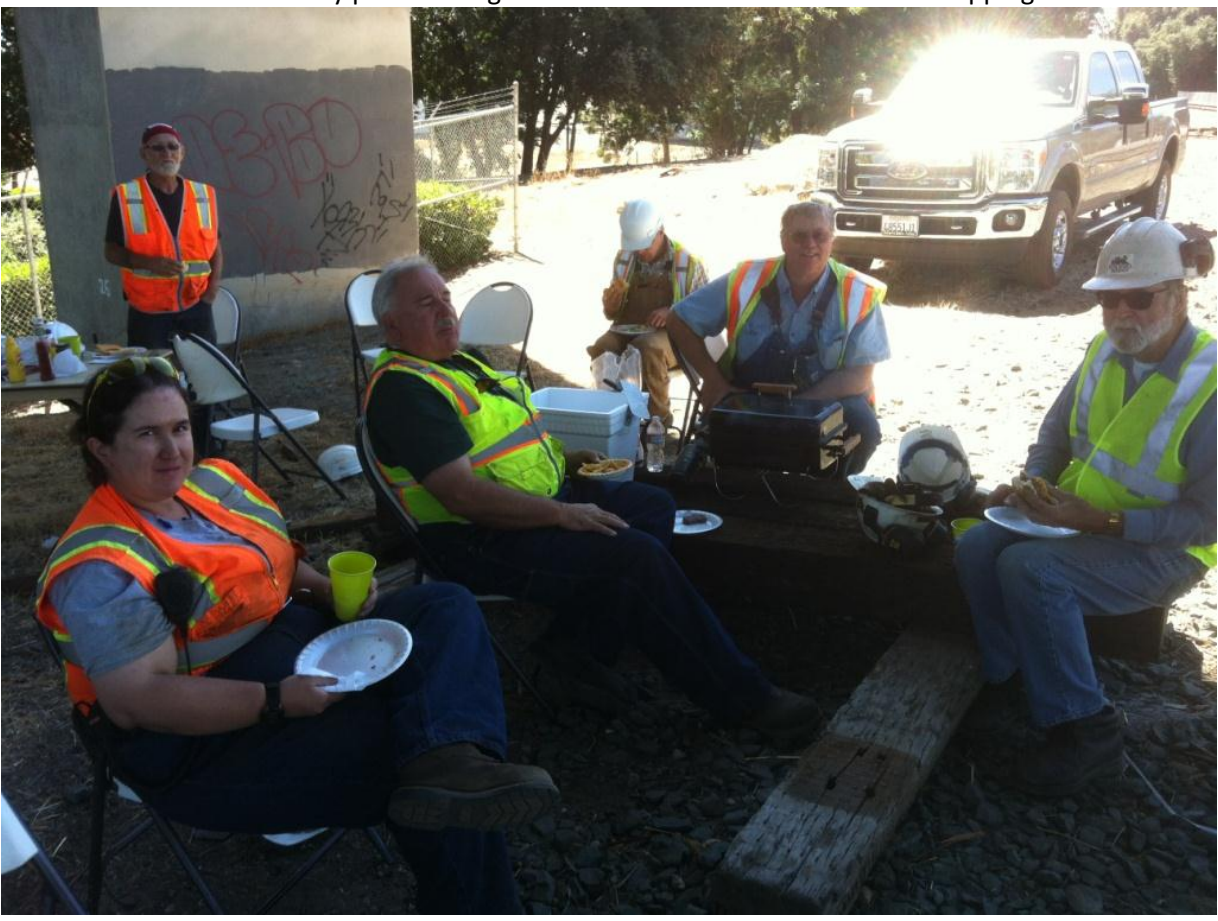
Reviving an ancient MOW tradition

"SSRR 2008 may pass red flags located at MP 1.2 and 1.4 without stopping..."