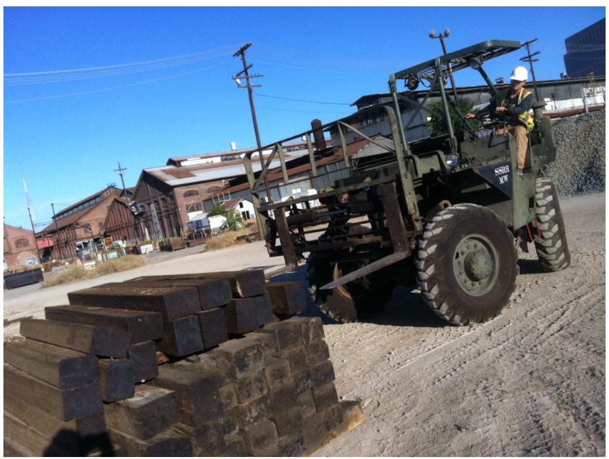
DJ on Big Green gathering ties