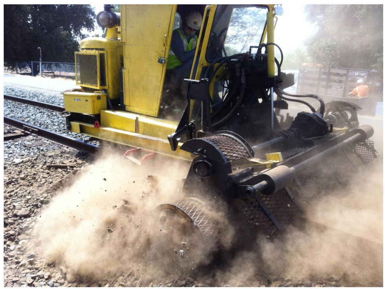
The scarifer scarifying...