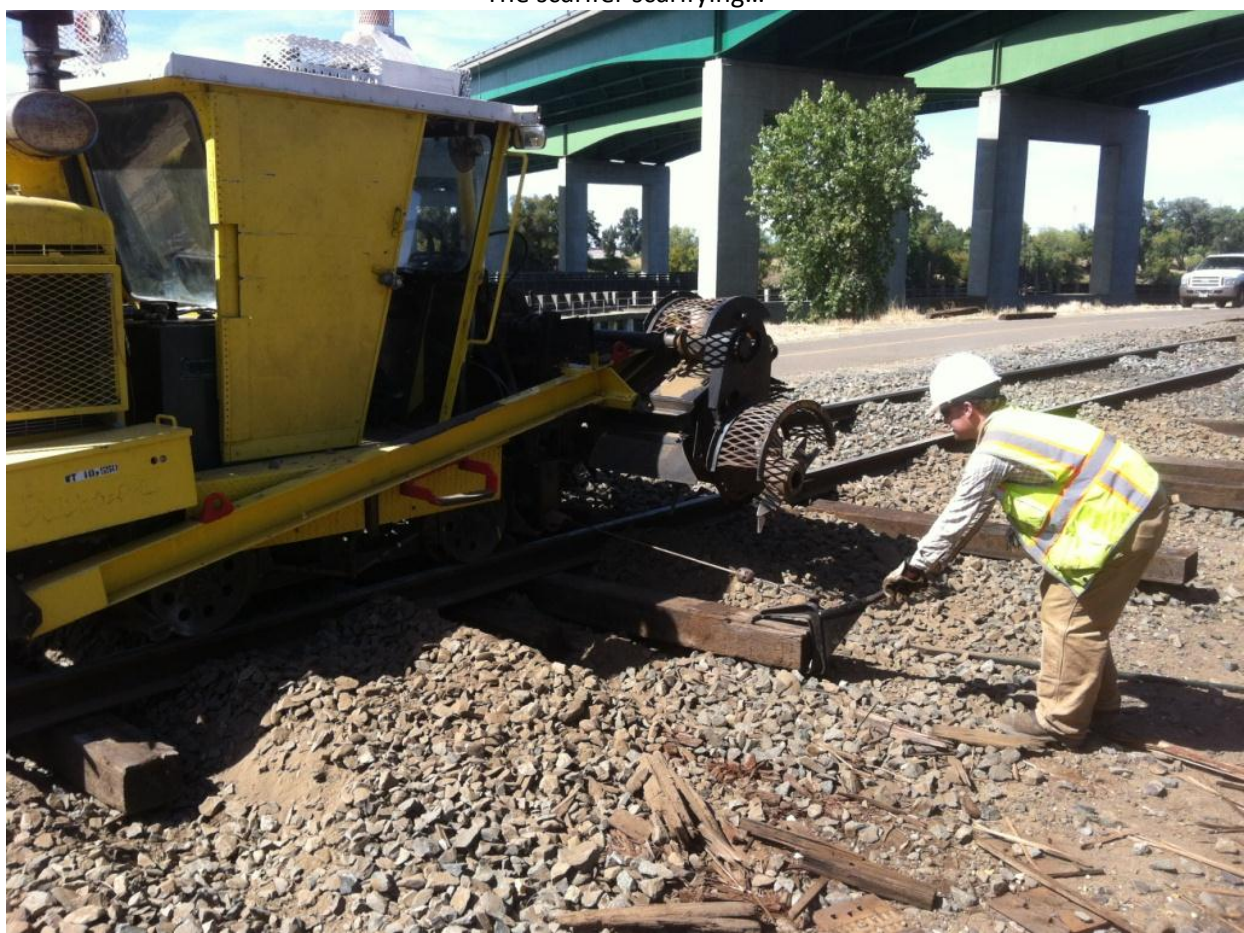
DJ using the inserter function to insert a tie