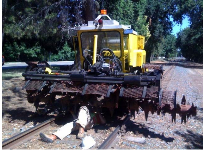
Mike performing field repair to the scarifyer prior to use in the tie change out project.