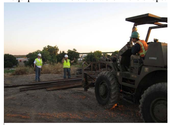
Bert and crew loading scrap rail at Clunie

Tuesday. First Pat and Gene worked in the shops unloading a motorcar and socializing. They were also able to trouble shoot a couple of engine issues with other pieces of equipment while there were in the shops. The second crew worked with an SSRR work